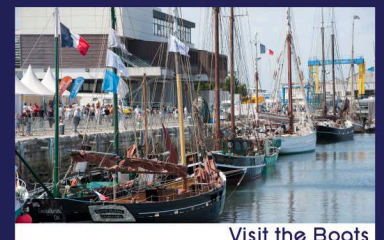
Visit the Boats