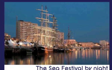
The Sea Festival by night