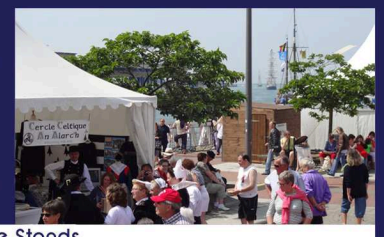
Live Music and Folklore