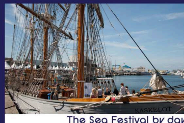
The Sea Festival by day