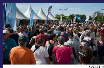
Visit the Stands